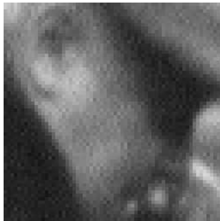
Figure 2: An image which illustrates some difficulties in recognition. Top : the image. Bottom left : Canny's edge detector applied to the image. Bottom right : A blow-up of the face showing the lack of recognizable features.